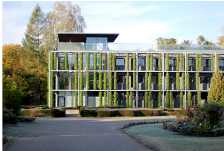
Botanical Garden in Kairėnai

Vilnius University Botanical Garden was founded in 1781. Since then historical circumstances has led to Botanical Garden being moved 4 times from one location to another. Today the Garden resides in two areas, Vingis Park and Kairėnai Estates, and is not only the largest in Lithuania (with combined total area of 199 hectares) but also have the most numerous collections of plants. There are growing about 9,925 taxa, belonging to 220 families and 1120 genera. Largest and most impressive collections are those of rhododendrons, lilacs, lianas, peonies, dahlias and bulb flowers.