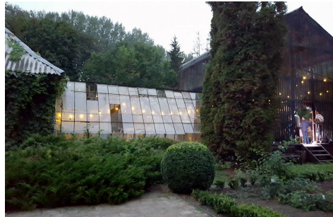
Vingis Department of Vilnius University Botanical Garden